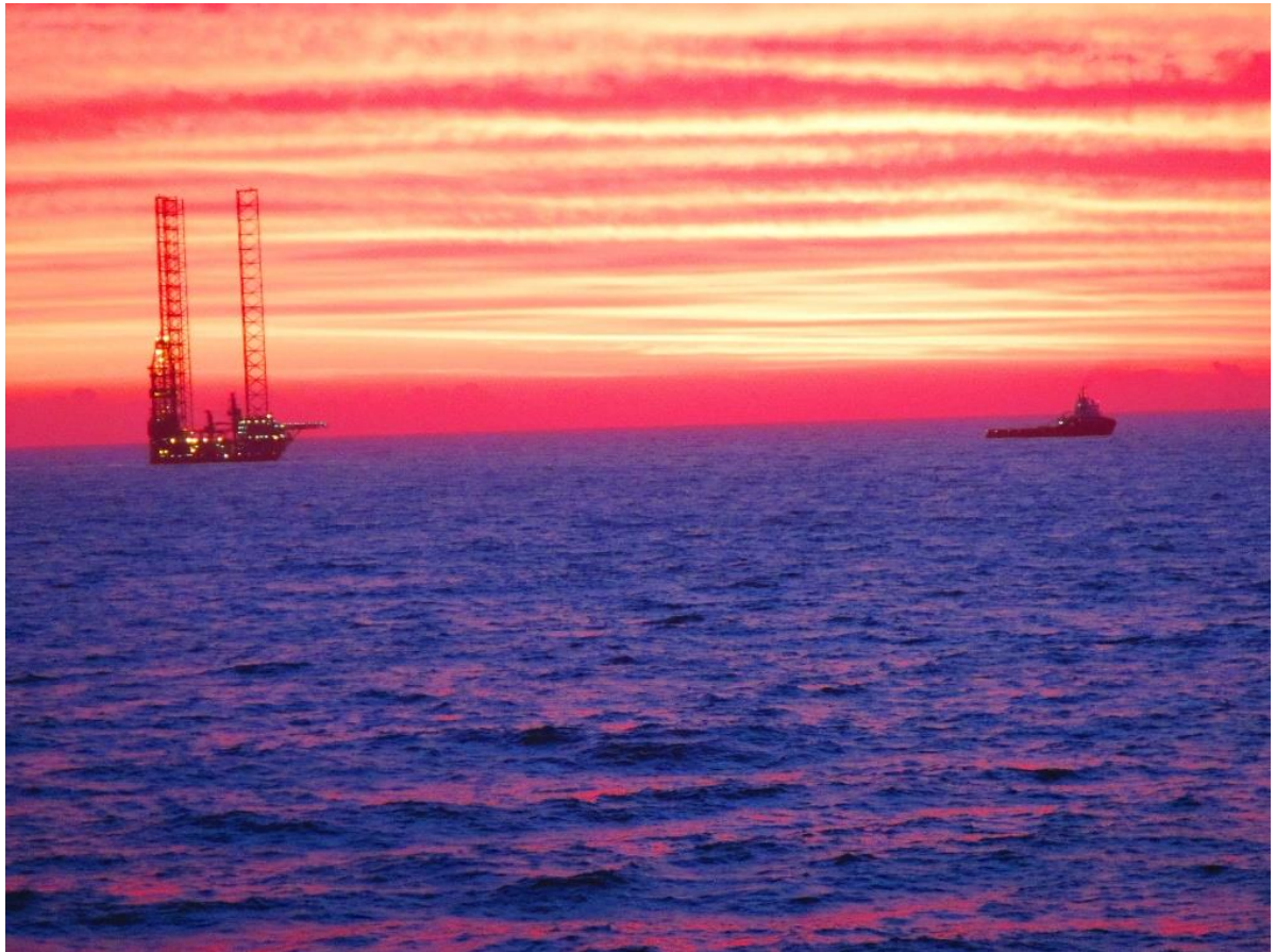
West Telesto drilling rig in tow to the Sea Lion site

The West Telesto drilling rig was assigned to CHPL on 20 October 2015 and arrived at the Sea Lion site two days later, following a 196 mile tow from its original location. Following an incident-free onsite preparation, the Sea Lion well was successfully spud at 9:45am (KL time) on 26 October 2015.